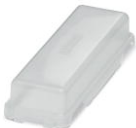
Protective covers, type: B24, degree of protection: IP20, color: transparent/white

Please be informed that the data shown in this PDF Document is generated from our Online Catalog. Please find the complete data in the user's documentation. Our General Terms of Use for Downloads are valid ( http://phoenixcontact.com/download )